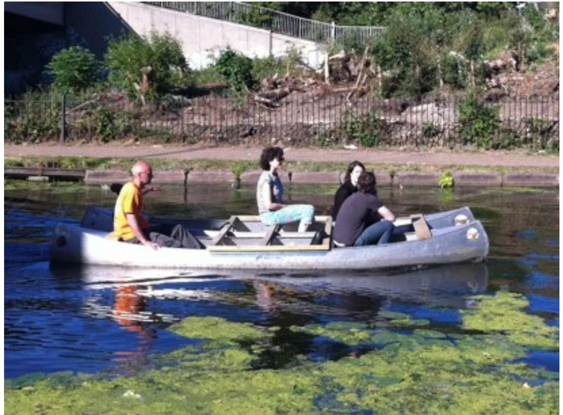
Trip Boat Prototype, River Lea