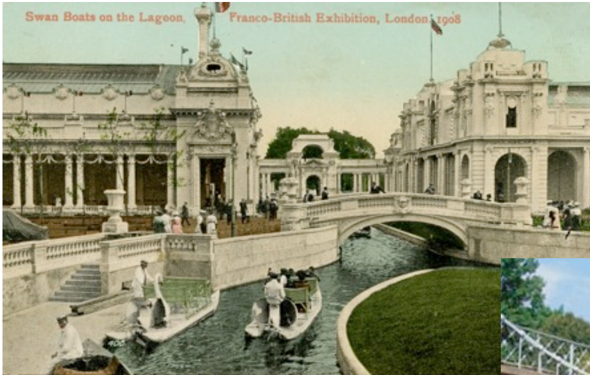
Swan Boats, London 1908