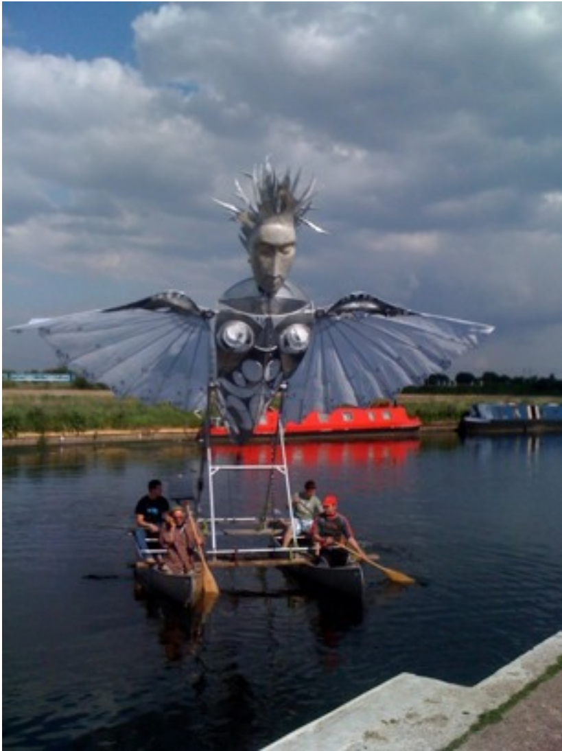
Arts Production, Private Lake