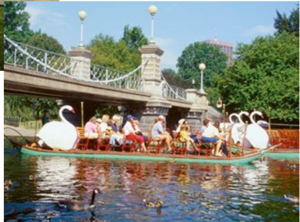
Swan Boats, Boston 2011, since 1870s